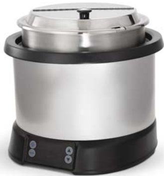
Mirage® Induction Rethermalizer